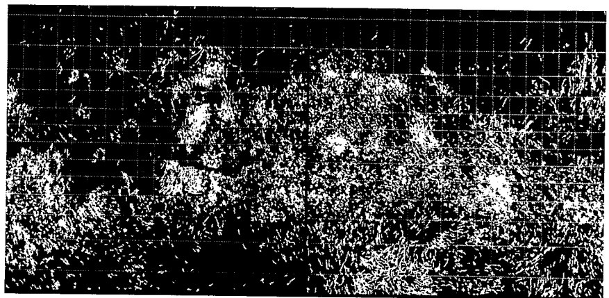
Fig. 2.—Computer-based Martian ridge distribution map, between latitudes of \pm 65^\circ .

peculiar surrounding ejecta facies (fig. 1) whose origin has been attributed to ejecta fluidization by subsurface volatiles within the target material (Mouginis-Mark, 1979). These craters were formed at relatively recent times when the meteoritic flux was about constant, and are generally younger than the ridges. There is no obvious latitude control of the different fluidized crater types distribution, with the exception of the pancake craters, which become much more numerous poleward of \pm 40^\circ . Pancake craters, with a much larger (3 to 6) ejecta range than the other fluidized crater types, indicate that volatile content was higher on the fractured terrains and smooth plains close to the poles, at the time they were formed.