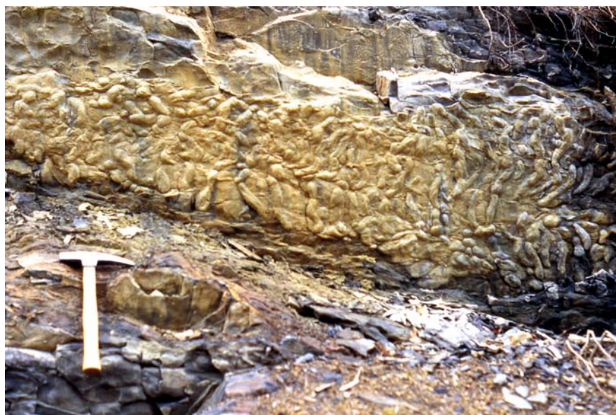
Fig. 4.- Trace fossil assemblage of the Cruziana Ichnofacies type.

Fig. 3.- Fotografía de detalle de estratos de arenisca con ripples simétricos.