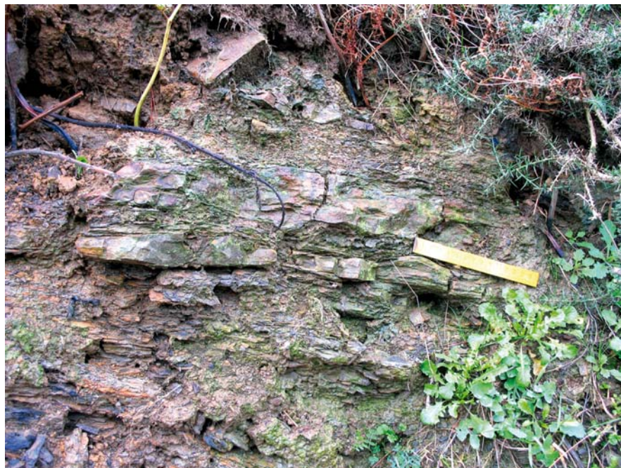
Fig. 3.- Detailed picture of sandstone beds with symmetrical ripples at tops.

The Mendiurkullu system succeeded the previous Aia-Zaldibia