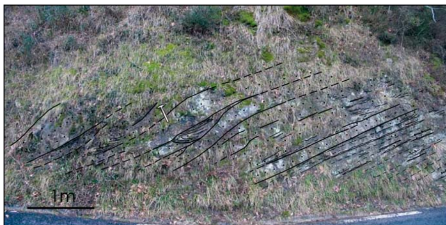
Fig. 5.- Laterally accreted sandstones through cross-stratification.

Fig. 4.- Traza de asociación fósil del tipo Cruziana Ichnofacies.